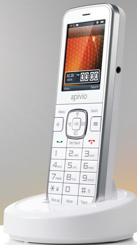
Shown with optional base charger.

The Liberty L2 is a modern design and stylish business Wi-Fi phone which provides excellent mobility with fast and seamless roaming. Compliant with IEEE802.11a/b/g/n, the Liberty L2 supports HD Codec G.711.1 and G.722 for crystal clear voice quality seamless communication.