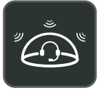
Acoustic Shield Technology

The Yealink WH62 is a new entry-level DECT wireless headset, with WH62 Dual and WH62 Mono two models. Work seamlessly with major UC platforms and integrate natively with Yealink IP phones. For crystal sound experience, Yealink Super Wideband Technology and Acoustic Shield Technology make you talk and hear clearly during phone calls and video conferencing. With easily on-ear control, interruption free, comfortable wearing, WH62 is a nice partner either for communicating or collaborating.