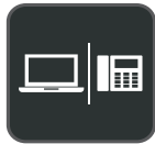
Multiple Devices Connection