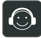
All Day Wearing Comfort