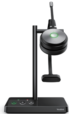
WH62 Mono Teams WH62 Mono UC