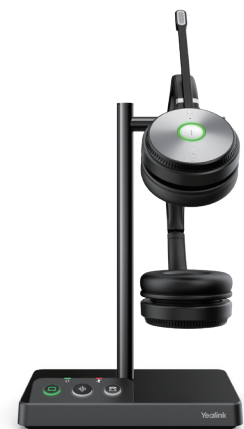
WH62 Dual Teams WH62 Dual UC

Based on hundreds of headform evaluations and thousands of wearing comfort tests, WH62 well meets the ergonomic requirements. Besides, with premier soft leather cushions and lightweight design, you can wear it all day comfortably. For more workspace freedom, WH62 can also free you up to 160m away from the desk.