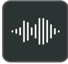
Optima Audio Experience